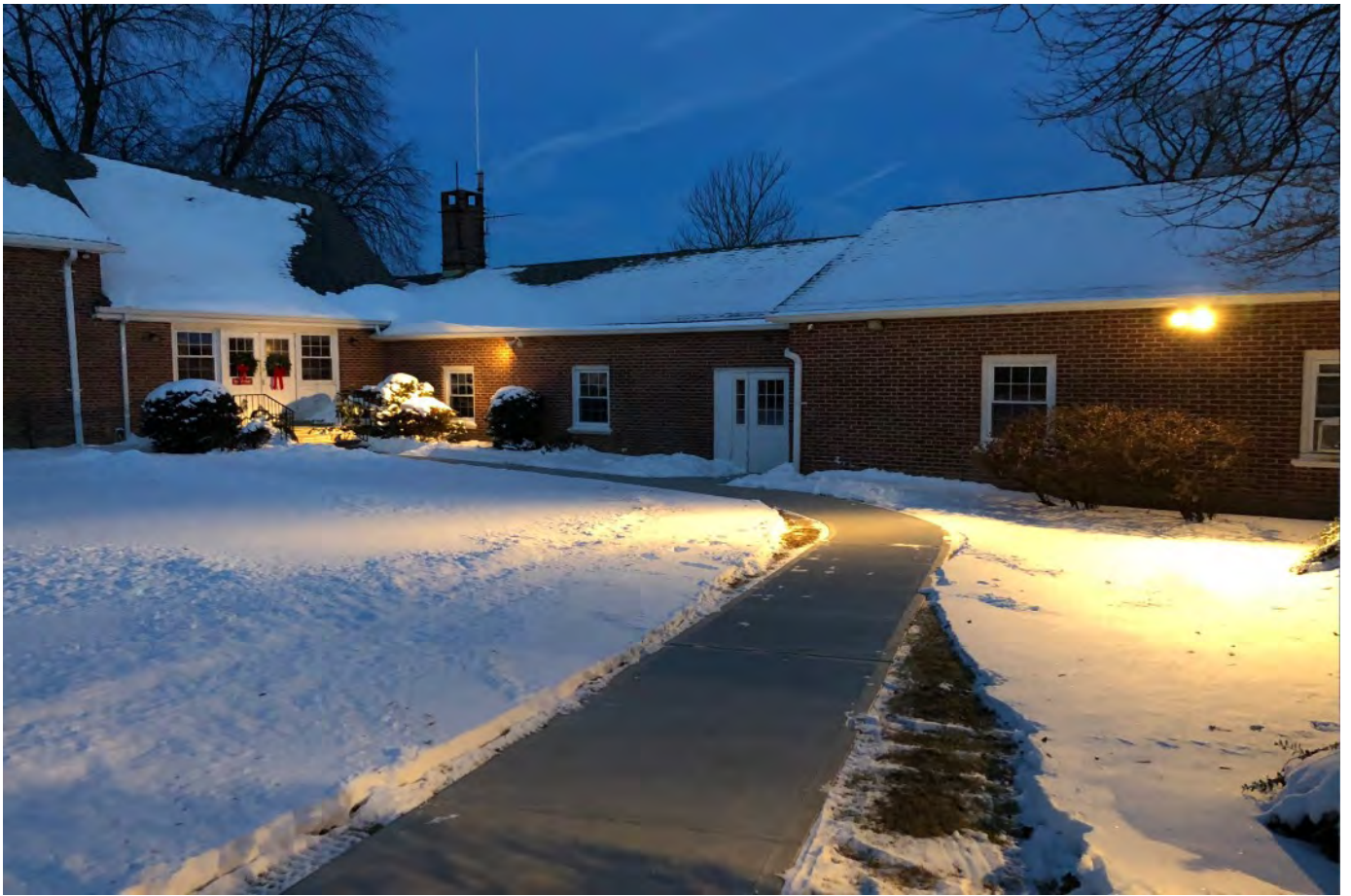
The beauty of the walk way at night